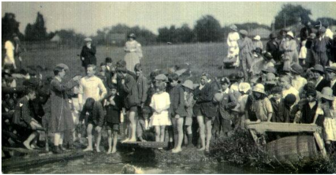
Children preparing to swim at the Bather, c.1930.