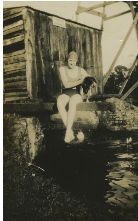
Woman sitting outside the changing hut by the Bather, 1930-40.

At Whitsun in 1963 a group of 30 fathers of children at the school arrived on the Sunday morning with spades, hammers and saws to work on the last part of this 'do-it-yourself' swimming pool project. The Croft Lane School became the first Primary School in Kent to have its own swimming pool. For the ensuing c.30 years, it was where many Edenbridge children learnt to swim.