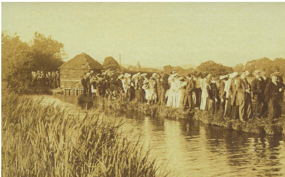
Spectators lining the River Eden near the Bather for a swimming gala. Changing huts in background. c.1900. Image: P2003.1028

During the first half of the last century, swimming lessons and galas took place at the 'Bather', an old Victorian weir pool about a mile upstream from Edenbridge and behind the Lingfield Road Recreation Ground.